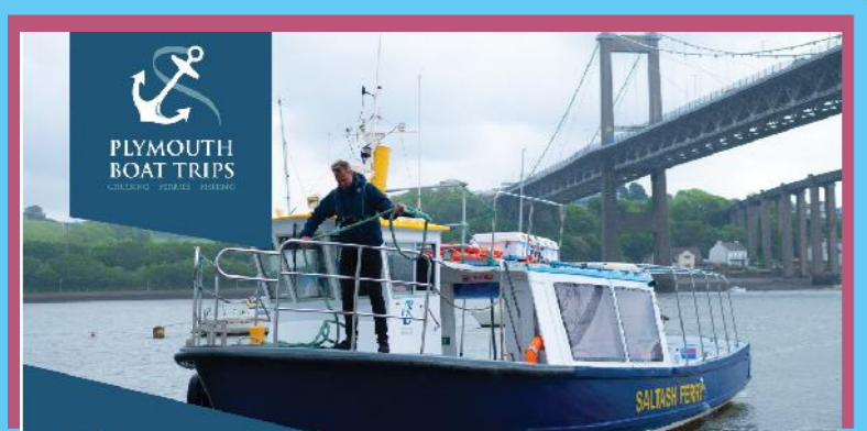
Plymouth Boat Trips