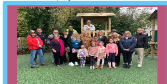
Grassmere Way Play Park - Grand Opening Pillmere Community Association

Town Team are currently leading the Fore Street Public Realm Project (more information on page 18).