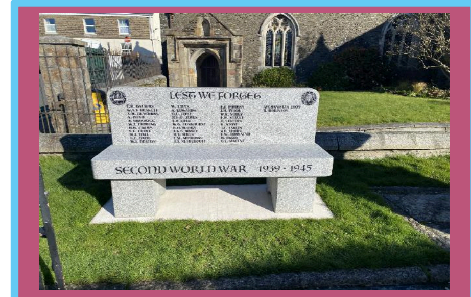
Saltash's Borough War Memorials

SEA has free hire of Isambard House for community talks and workshops on environmental issues and awareness which the public are invited to attend.