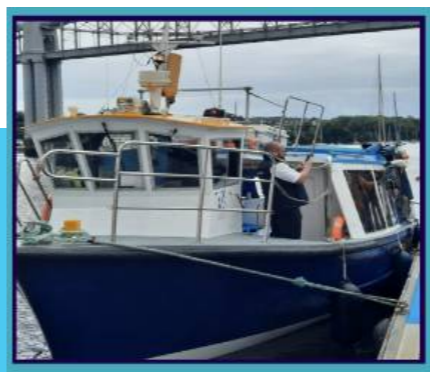
TRAVEL AND TRANSPORT

By working alongside Cornwall Council and referring consistently to the approved Saltash Neighbourhood Plan, the Town Council will continue to endeavour to identify suitable development sites, encourage sustainable housing designs, and promote inclusive housing policies that cater to varying income levels.