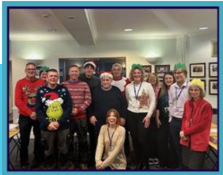
BOOSTING JOBS AND ECONOMIC PROSPERITY

The Town Council recently considered and approved six strategic priorities for the next three years to ensure Saltash becomes an envied riverside town, being greener, more inclusive and prosperous.