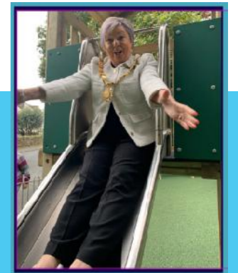
RECREATION AND LEISURE

Saltash Town Council is dedicated to transitioning its fleet to 100% electric vehicles in order to reduce its carbon footprint.