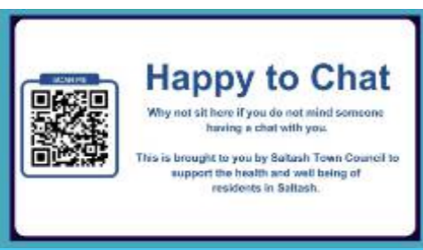
HEALTH AND WELLBEING

Saltash Town Council has also recruited new staff to better support the community. Additionally, the Council promotes Saltash through the Station facilities and supports festivals and community projects via its Grant and Match Funding Policies.